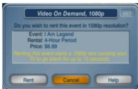
Initial VOD Popup #993