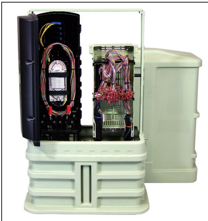
CMPH-7500 Copper / Fiber Co-Location Configuration