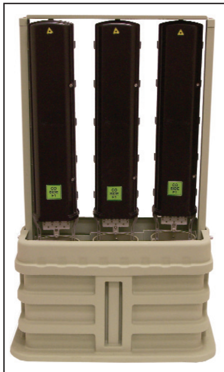
CMPH-7500 Cell-Site Configuration (Wireless Backhaul to Multiple Service Providers)