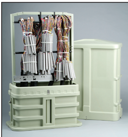
CMPH-7500N Copper Configuration

In cell site applications, the CMPH 7500 enclosure is ideal for installation either inside or outside the tower's fence line, without the need to construct a concrete pad. The enclosure can be configured with one, two or three independent two-sided fiber backboards with integrated connectorized bulkheads and fusion splice storage trays. This multi-backboard enclosure design allows the backhaul service provider to partition fiber access to multiple cellular providers from a single enclosure, with each end user having secure access to only their fiber connections.