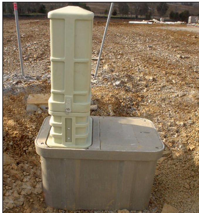
CMPH-7500 Vault-Lid Mounting (Requires Optional Hardware Mounting Kit, Copper or Fiber Cable Slack Storage)