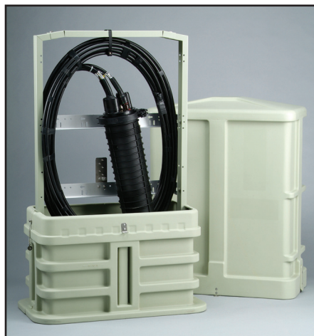
CMPH-750FN Fiber Configuration