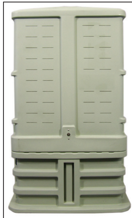
CMPH-7500 Vented Lid Option for Housing Weather-Hardened Active Electronics