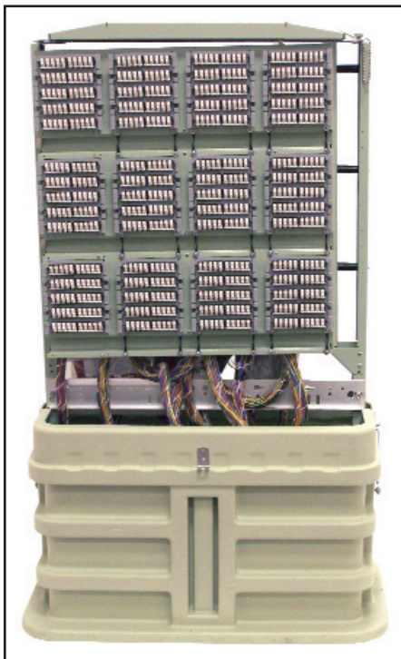
CMPH-7500 Copper Cross-Connect Configuration (900 Pair shown)