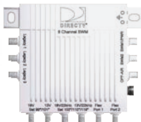
8-Channel SWM Module