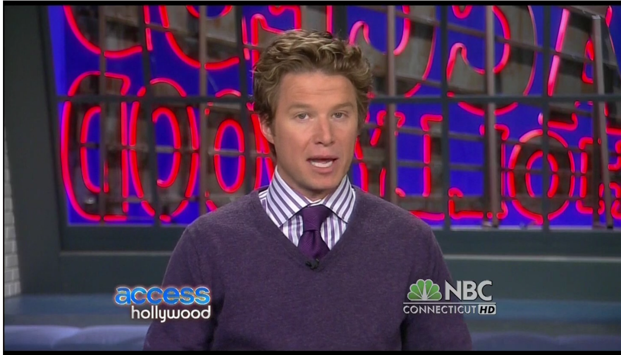
(Even Billy Bush looks good in HD via the DISH Sling Adapter)

I do hope that DISH will come up with a way to allow us to create a different login we can give to our kids or friend without exposing our full DISH Network account, or better yet come out with a new version of the stand alone Slingplayer application which uses our Sling login, like we have for years with out regular Slingboxes.