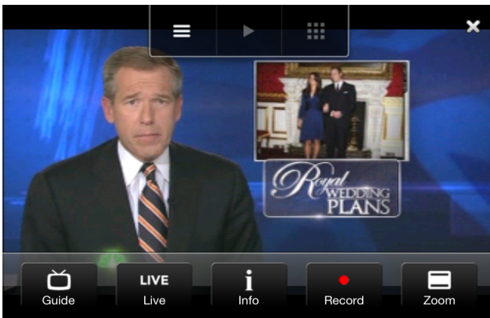
(Screenshot from iPhone DISH Remote Access App)

So far the only places you can watch video from your DISH Network Sling Adapter is at DISH.COM and on you iPhone using the new DISH Remote Access application. However DISH will soon be releasing a new free DISH Remote Access app for the Android device soon that will let you enjoy your TV anywhere.