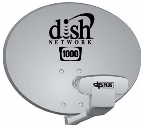
DISH 1000.2 with DP Plus 1000.2 LNB